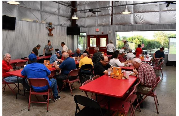
Meeting Room at Bigz