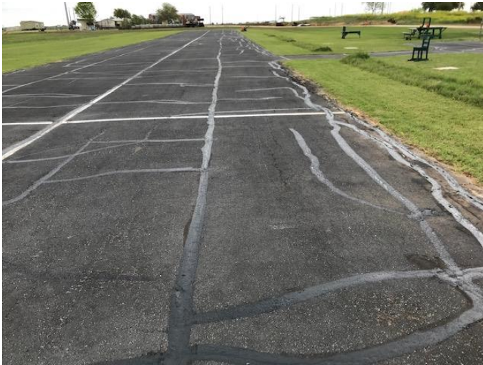
The before, lots of issues

On March 11 and 12 the field was closed for resealing the runway and pit areas. The results are impressive, looks like new. Here are some before and after photos: