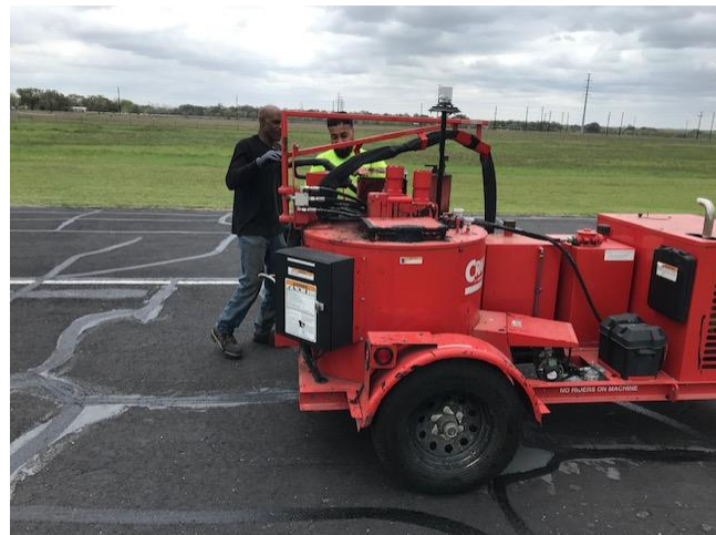
The magic machine for re-sealing