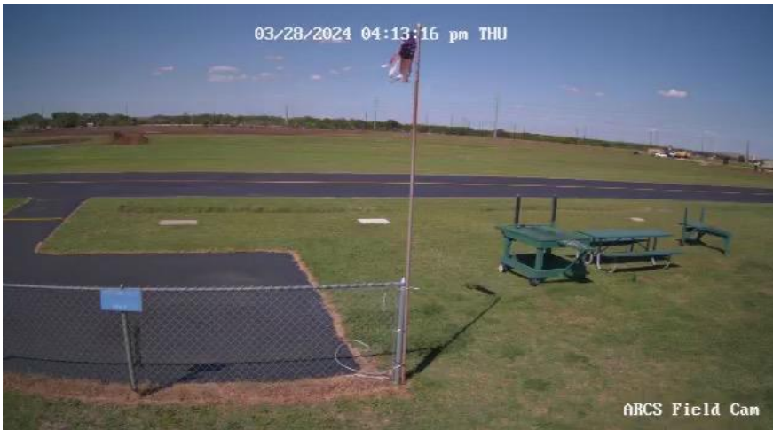
The pit area looks good too.