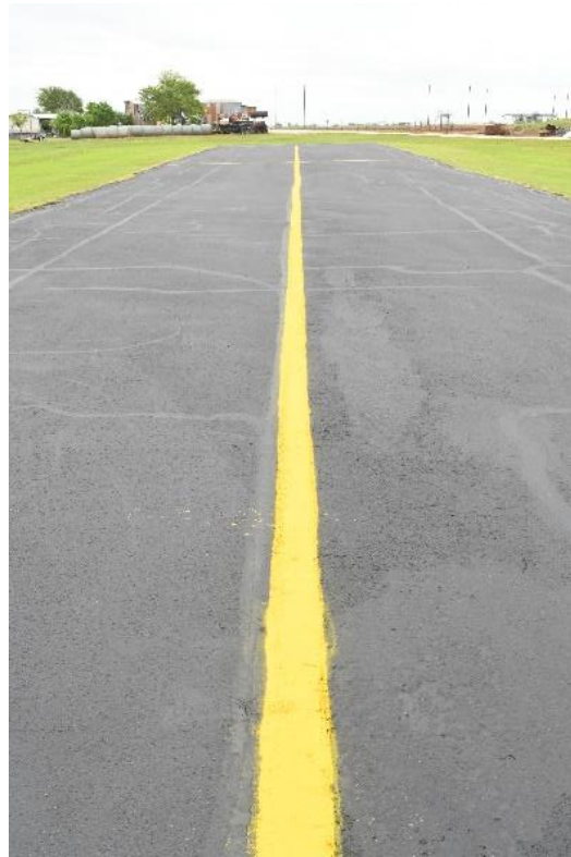
The After, Looks really nice