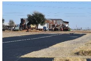
East end of runway

January saw another membership addition. Four members of a drone company joined the club and will be flying drones periodically at the field.