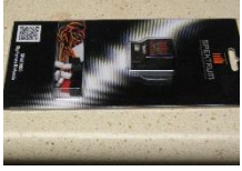
Horizon Sky Remote ID

I received my remote ID devices from Horizon Hobby. They're about the size of a receiver and have multiple ways for being powered in an airplane. I'll have to register their ID numbers with the FAA. If you fly at the field you do not need them. But what fun is that? I enjoy being able to put an airplane up in a different place, be it road, and field, park, pond or lake. When away from a FAA Recognized Identification Area (FRIA), you will need the remote ID. Our flying field is a FRIA so no remote ID devices are required to fly there.