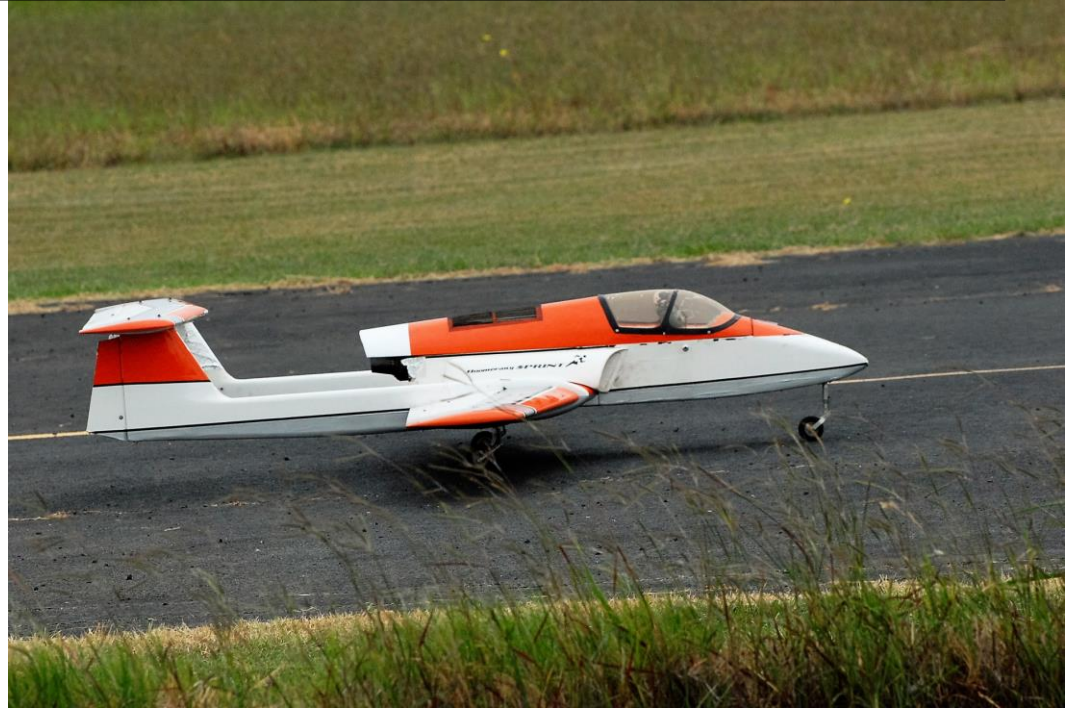
Pete Dubree braved the strong crosswinds with his Sprint turbine jet.