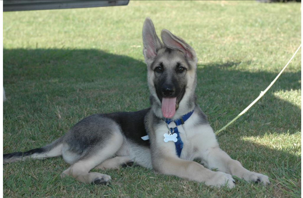
Dog Days of Summer. It was hot and humid!